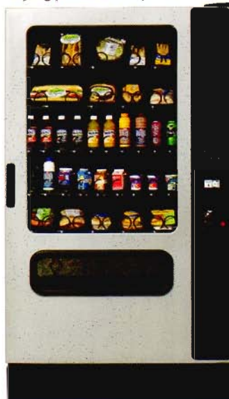
Shown in silver with interface decal & kick panel.