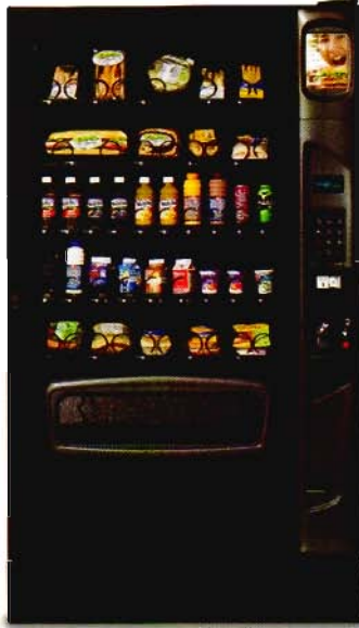
Shown in black with optional styling panels & kick panel.