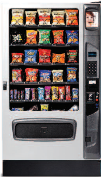
M5000 Shown with optional ADA door, custom door color & kick panel.