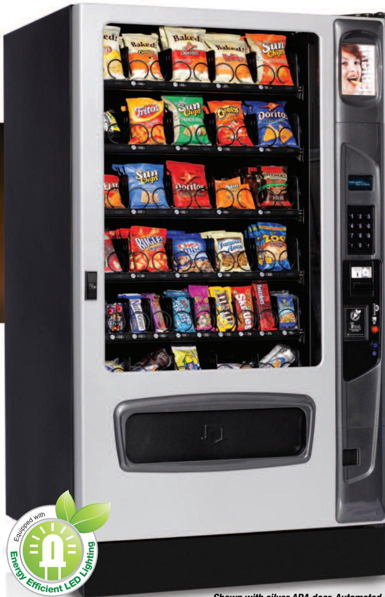
Shown with silver ADA door, Automated Delivery Assist and kick panel options.

The Mercato 5000 glass front snack merchandiser incorporates all the proven features you expect in a new design and includes additions that increase the value for choosing USI.