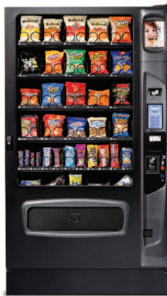
M5000 Shown with optional ADA door, iCart touch screen & kick panel.